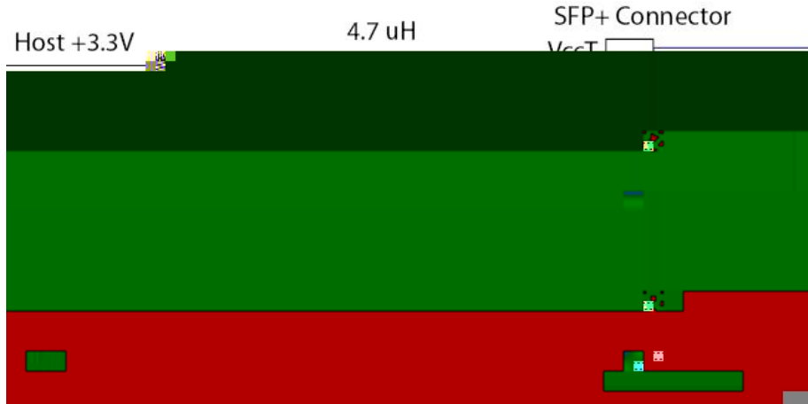
Figure3. Host Board Power Supply Filters Circuit